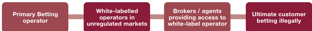
Figure 2 – The relationship of betting operators to white-labelled operators, bet brokers and ultimate customers

The distance of the ultimate customer to the primary operator is illustrated in the diagram below: